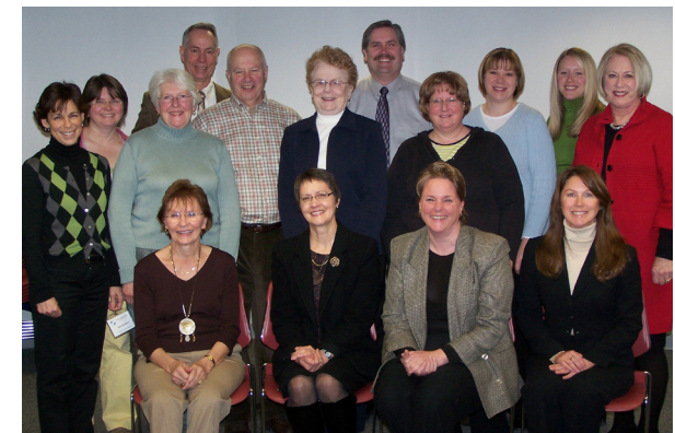
2009 Board of Directors & Staff